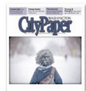
The Issue of Feb. 12 - 18, 2010