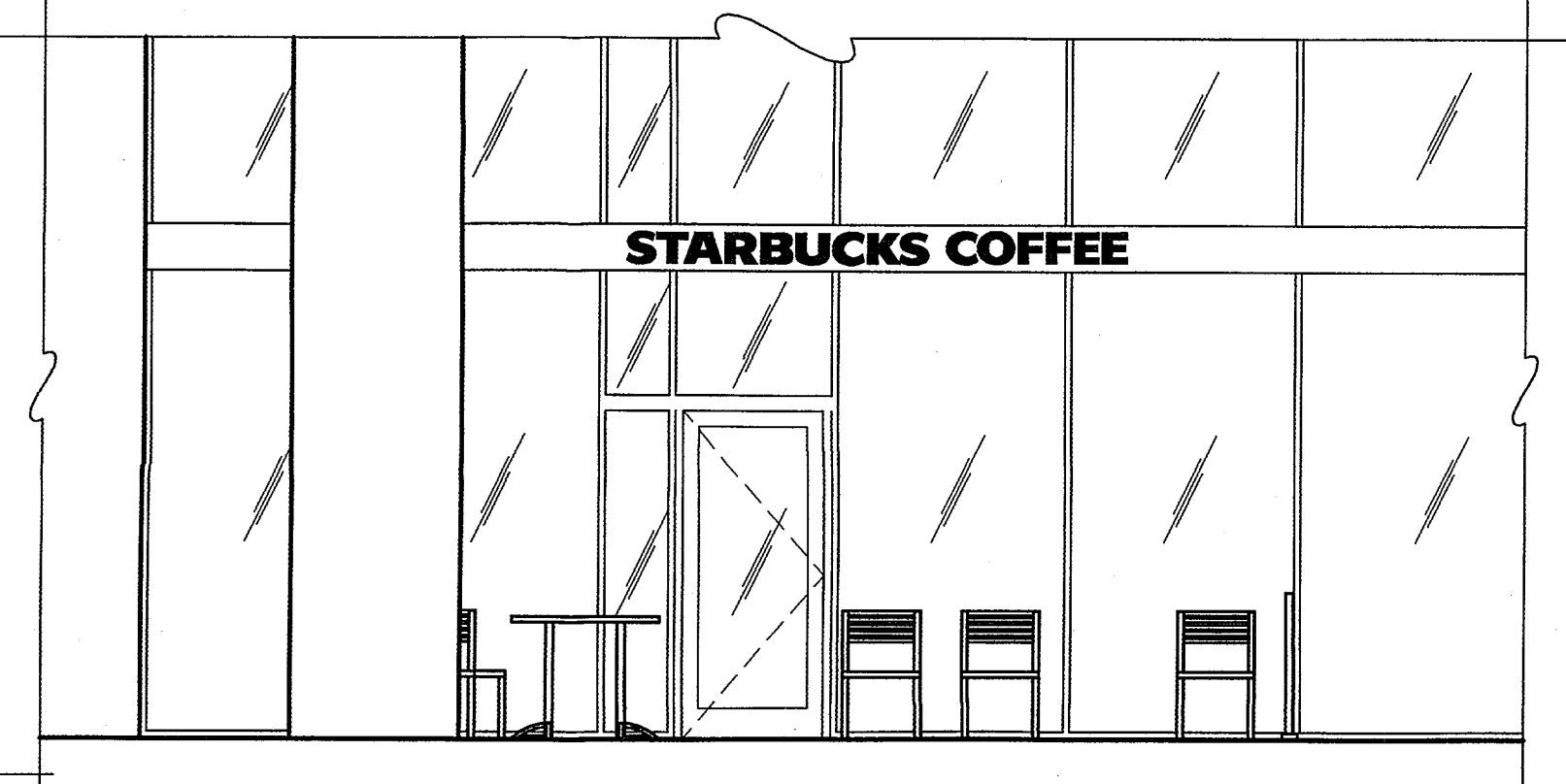
4 A-1 ELEVATION OF EXTERIOR SCALE: 1/4" = 1'-0" Chairs shown in elevation are representational. Not all chairs shown for clarity.

OFFICIAL SEAL GOVERNMENT OF THE DISTRICT OF COLUMBIA PERMITTING OPERATIONS DIVISION I hereby certify that the above work was prepared by me or under my direct supervision and complies with the applicable provisions of the District of Columbia Code and the rules and regulations of the Permitting Operations Division.