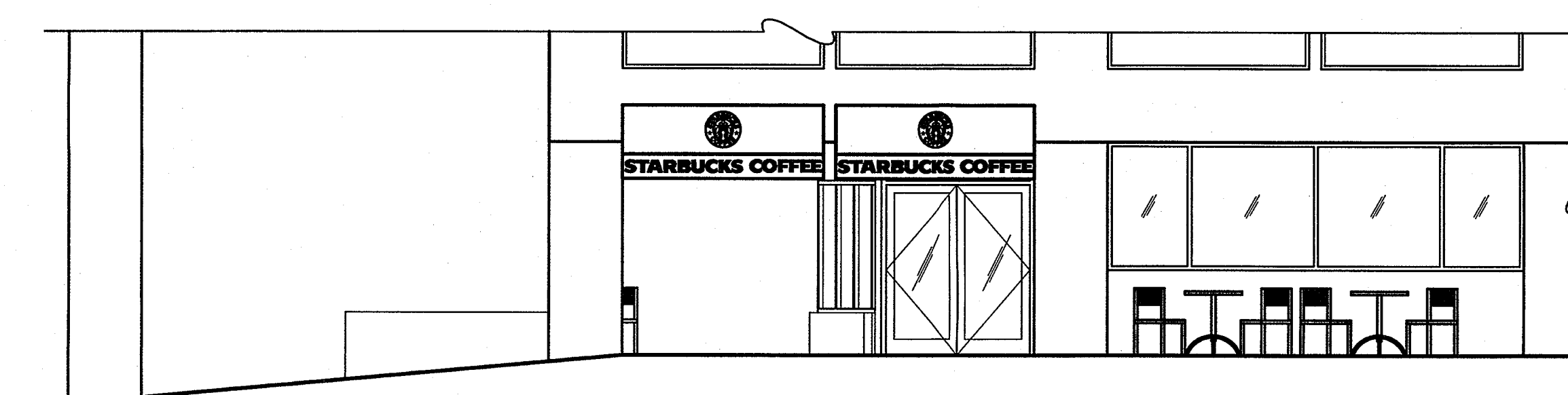
4 A-1 ELEVATION OF EXTERIOR SCALE: 3/8" = 1'-0"

Chairs shown in elevation are representational. Not all chairs shown for clarity.