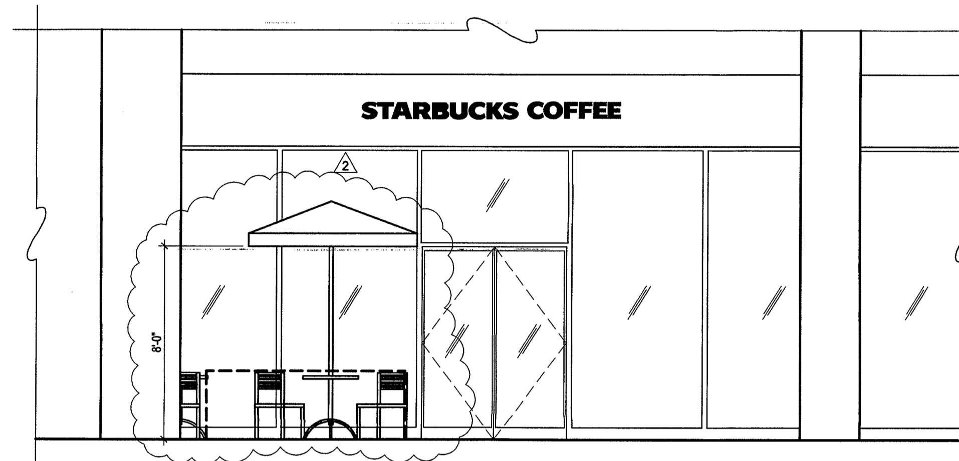
3 A-1 ELEVATION OF EXTERIOR SCALE: 1/4" = 1'-0" Chairs shown in elevation are representational. Not all chairs shown for clarity.

APPROVED NO DEVIATION ALLOWED WITHOUT PROFESSIONAL SEAL FROM THIS OFFICE Catrina Harrison 11/29/11 SIGNATURE DATE